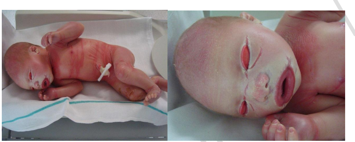
Figure 1: Physical examination of the neonate showed a thick keratin-coated skin with fissures. Restricted moving of hands and feet was noticed. There was eclabium (eversion of the lips) and bilateral ectropion.